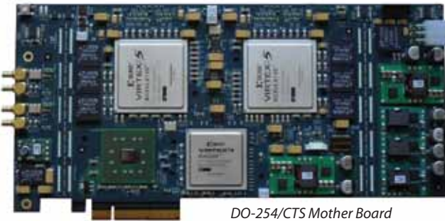
DO-254/CTS Mother Board

In compliance with the document FAA AC 20-152, verification at the FPGA level must be done to ensure completeness of testing. FPGA level verification is performed before system level verification. All FPGA level requirements verified using DO-254/CTS do not have to be verified again at the system level per RTCA/DO-254 specification sections 6.2 and 6.2.2.