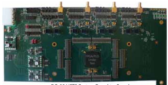
DO-254/CTS Custom Daughter Board

The design must be tested in the target device per RTCA/DO-254 specification sections 1.1 and 6.3.1. DO-254/CTS consists of a custom daughter board that contains the specific family/package or part number of the FPGA/PLD device from vendors such as Altera, Lattice, Microsemi (Actel) and Xilinx.